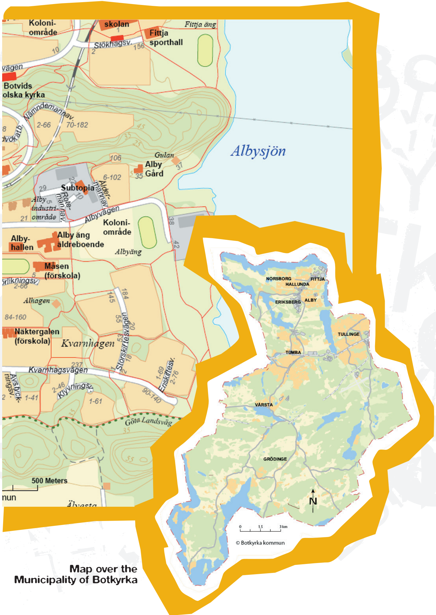
Map over the Municipality of Botkyrka